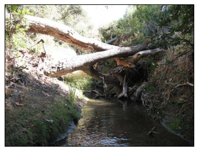
Fallen Trees Due to Bank Erosion in the Creeks

increase sediment loading, channel erosion, and other stressors that already have an impact on watershed functions. Climate change may also endanger existing habitat and could present increased hazards to both human and animal life in the watershed.